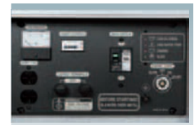
Control panel: YEG140